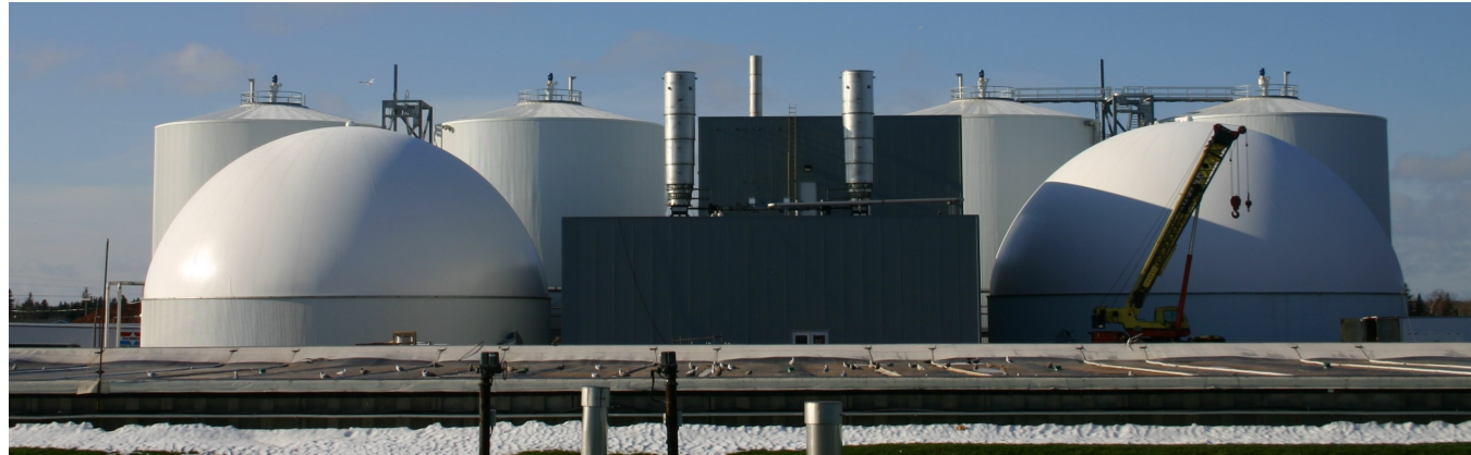
Biogas plant in Canada

The large number of tank diameters and heights allows to provide the correct tank for every plant.