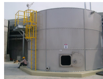
Waste water project - Singapore