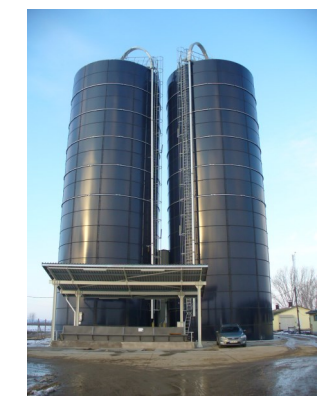
Corn silo - Hungary