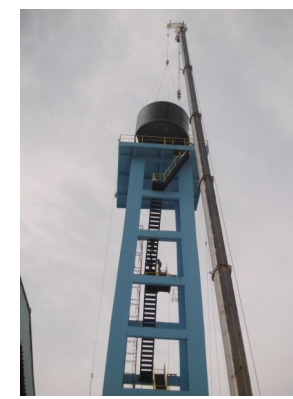
Drinking water - Indonesia