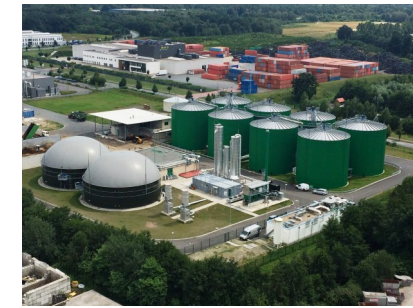
Biogas - Germany