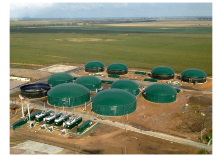
Biogas - Belarus