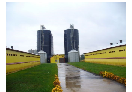
Corn silo - Russia