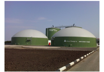
Biogas - Russia