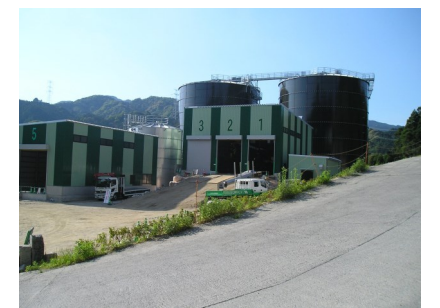
Biogas - Japan