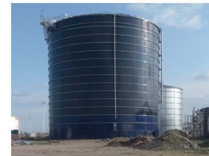
Biogas - Argentina