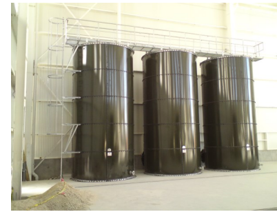
Waste water project - Mexico