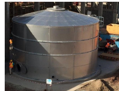
Drinking water - Ethiopia