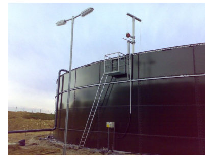
Slurry store - Hungary