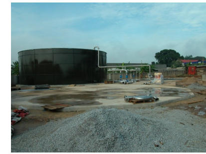
Waste water project - Ghana