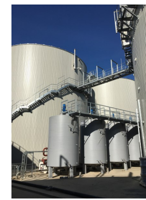
Biogas - UK