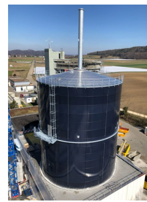
Gas storage tank - Switzerland